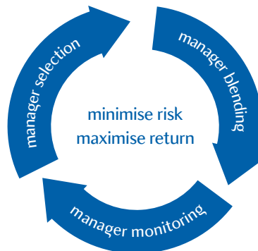
The skandia investment management process

And they monitor daily to make sure the selected managers remain the best. If their performance falls off, or their discipline wanes, then they are replaced. Investors know that their portfolios remain in the hands of today's stars - not yesterday's.