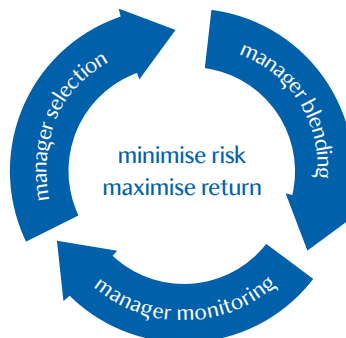
The skandia investment management process

And they monitor daily to make sure the selected managers remain the best. If their performance falls off, or their discipline wanes, then they are replaced. Investors know that their portfolios remain in the hands of today's stars - not yesterday's.