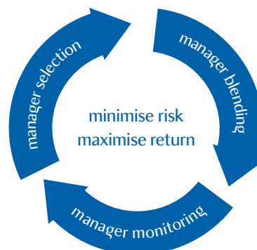
The skandia investment management process

And they monitor daily to make sure the selected managers remain the best. If their performance falls off, or their discipline wanes, then they are replaced. Investors know that their portfolios remain in the hands of today's stars - not yesterday's.