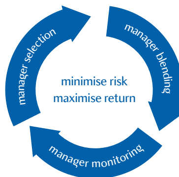
The skandia investment management process

And they monitor daily to make sure the selected managers remain the best. If their performance falls off, or their discipline wanes, then they are replaced. Investors know that their portfolios remain in the hands of today's stars - not yesterday's.