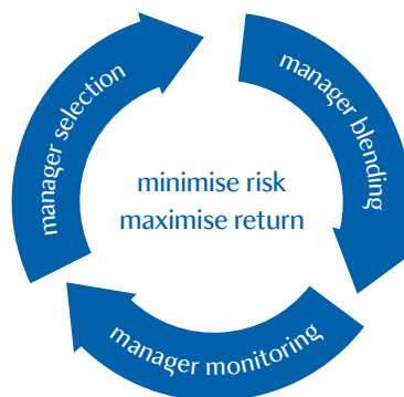
The skandia investment management process

And they monitor daily to make sure the selected managers remain the best. If their performance falls off, or their discipline wanes, then they are replaced. Investors know that their portfolios remain in the hands of today's stars - not yesterday's.