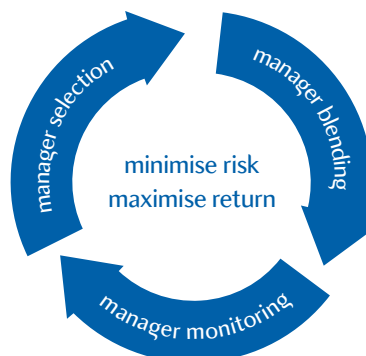
The skandia investment management process

And they monitor daily to make sure the selected managers remain the best. If their performance falls off, or their discipline wanes, then they are replaced. Investors know that their portfolios remain in the hands of today's stars - not yesterday's.