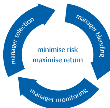
The skandia investment management process

And they monitor daily to make sure the selected managers remain the best. If their performance falls off, or their discipline wanes, then they are replaced. Investors know that their portfolios remain in the hands of today's stars - not yesterday's.